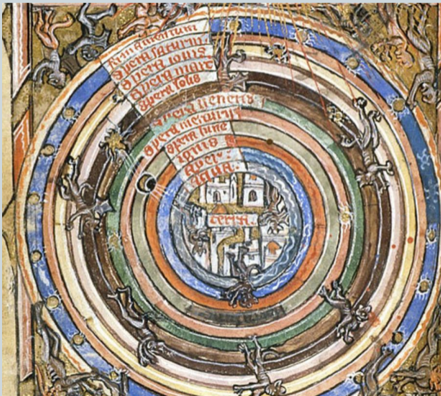
The Problem of Celestial Matter